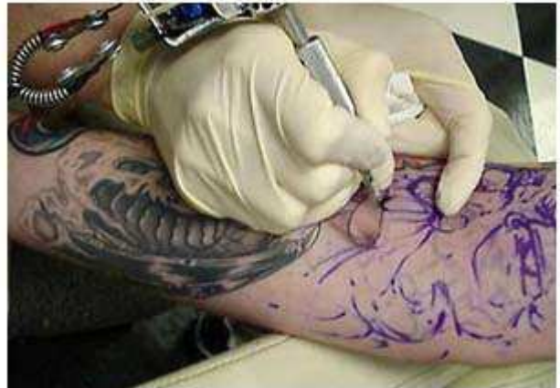
A tattooing machine can puncture the skin 3,000 times a minute. And every prick is an open door to fatal blood-borne diseases.

hepatitis is detected the better the chances for survival. If you have a tattoo – get checked.