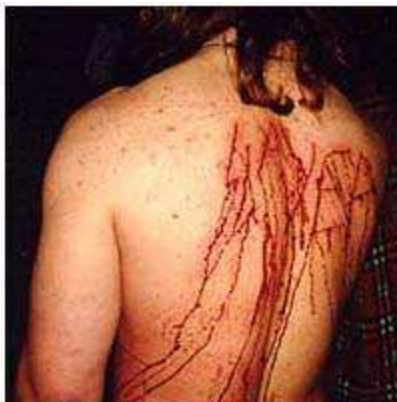
BLOOD-LETTING ROCK FAN